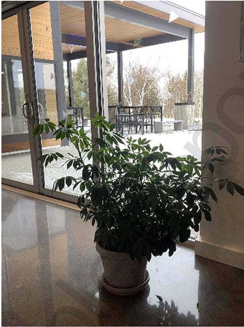
c) Merch facing 258 degrees