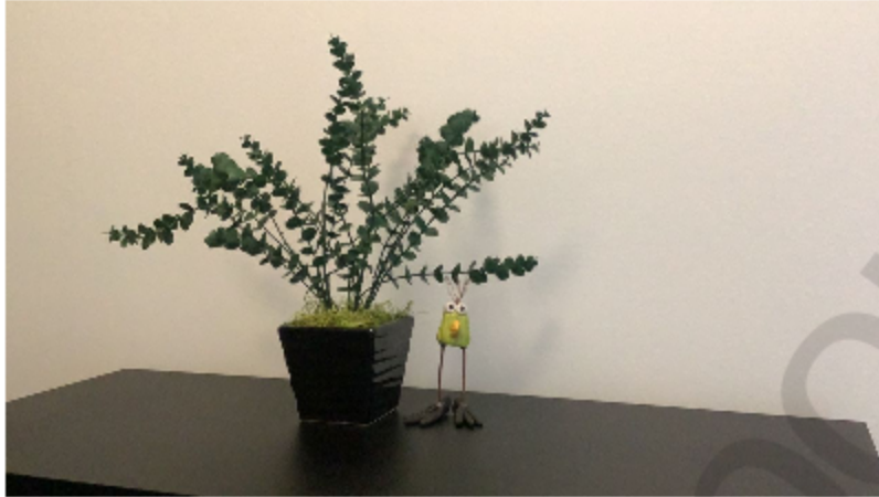
c) Plants facing 29 degrees