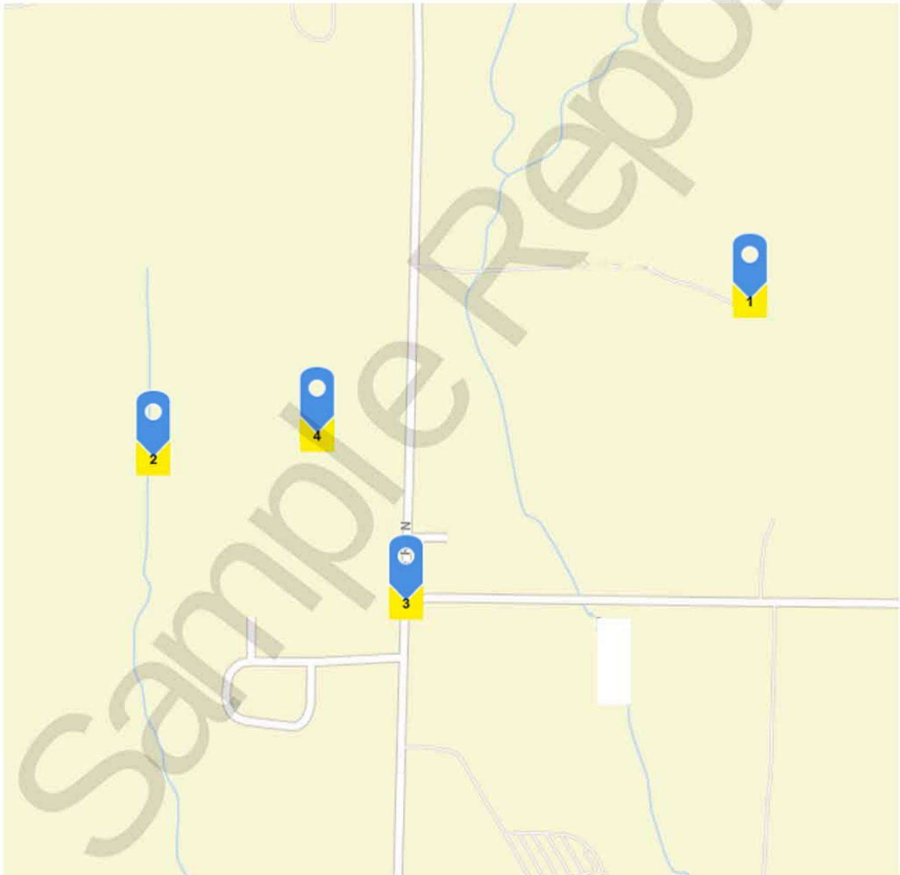
PHOTO POINT MAP

Esri Community Maps Contributors, GTC Equalization/GIS, © OpenStreetMap, Microsoft, Esri, To... Powered by Esri