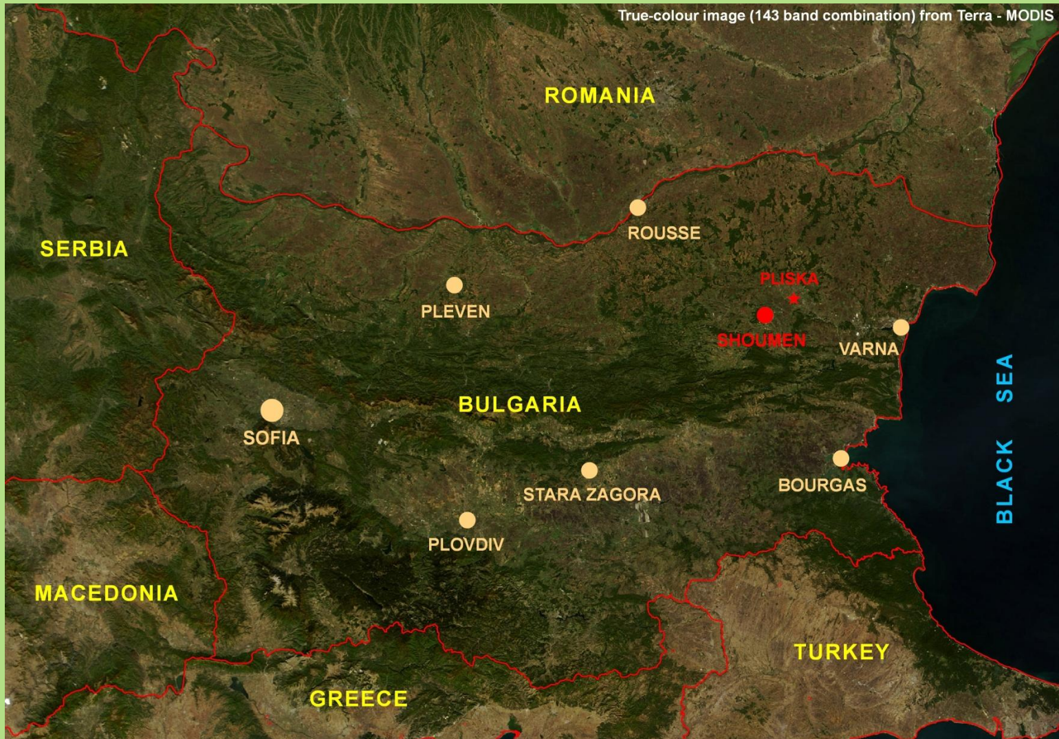
Location of the study area