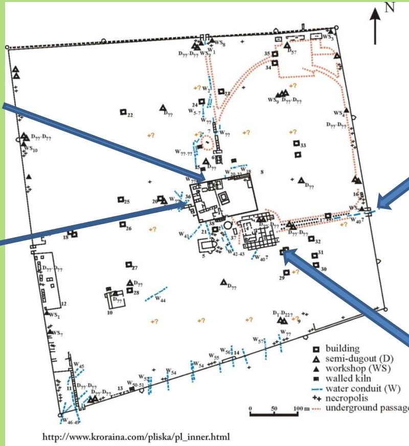
Map of the Inner Town /by Rashev R. , Y. Dimitrov, 1999/