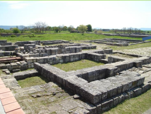
View from the Citadel