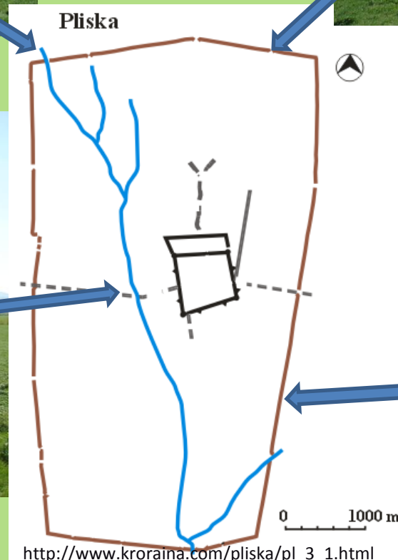
Overview from different points of the Outer Town