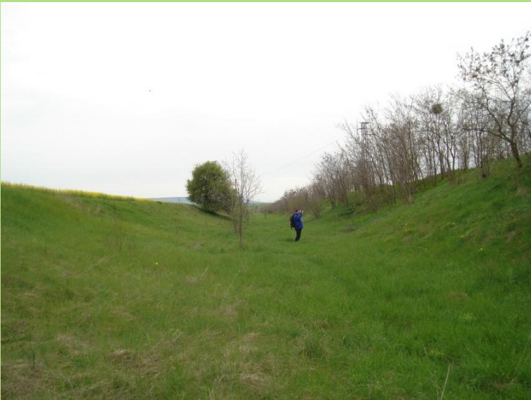
View from the Western rampart of the Outer Town