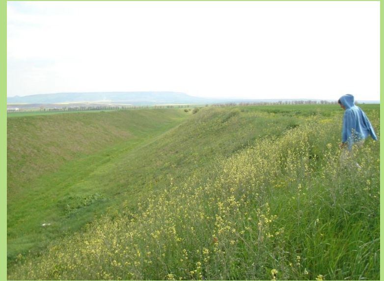
The ditch of the side of the Outer Town