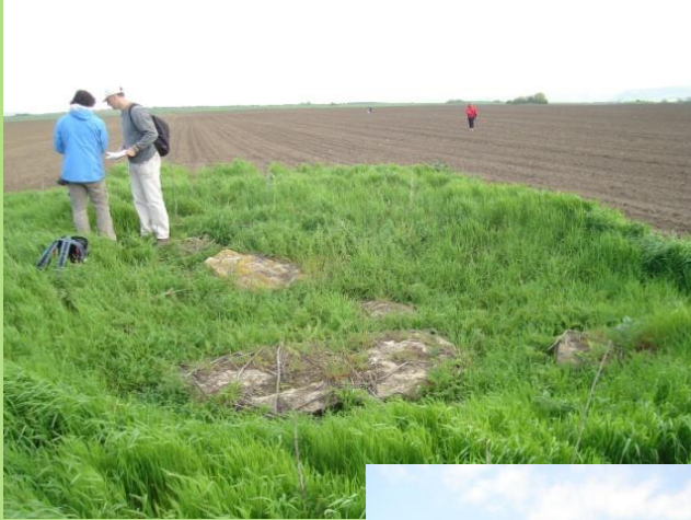
Team of archaeologists doing field survey