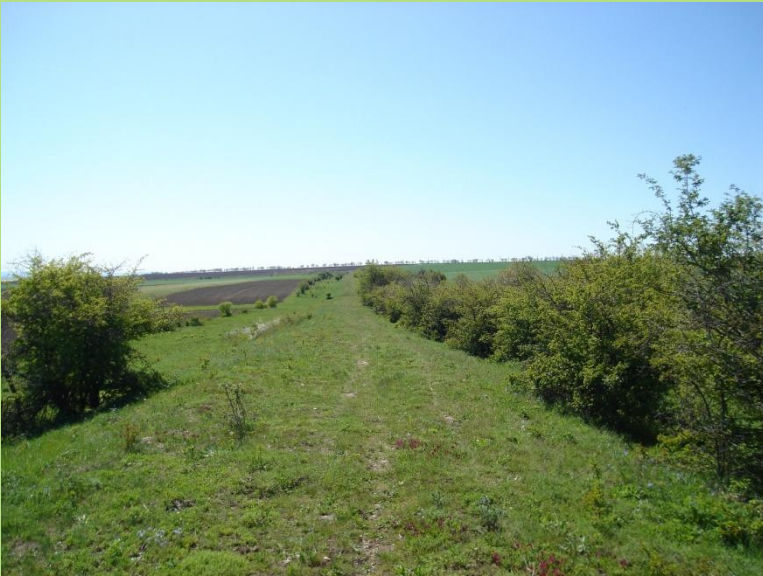
View from the Northern rampart of the Outer Town