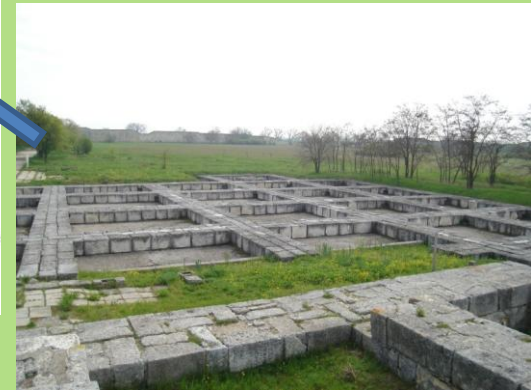
View from the Krum's palace