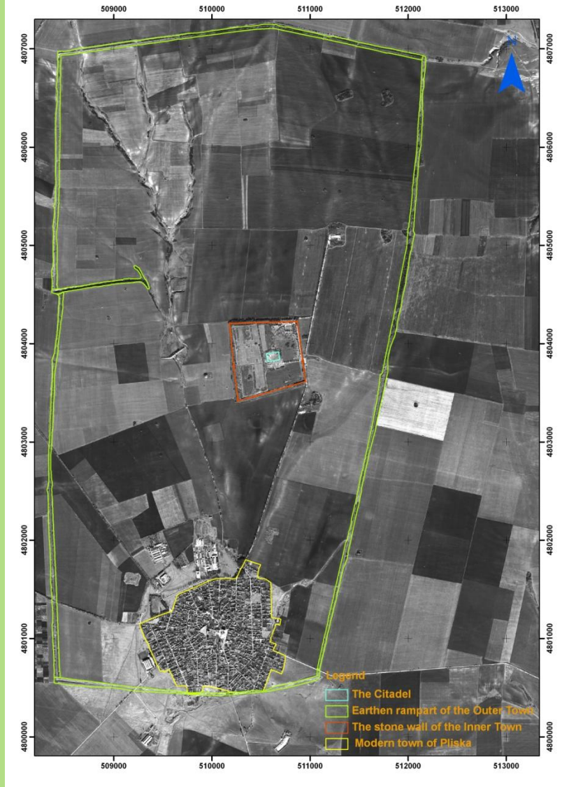
Overview of the medieval town of Pliska