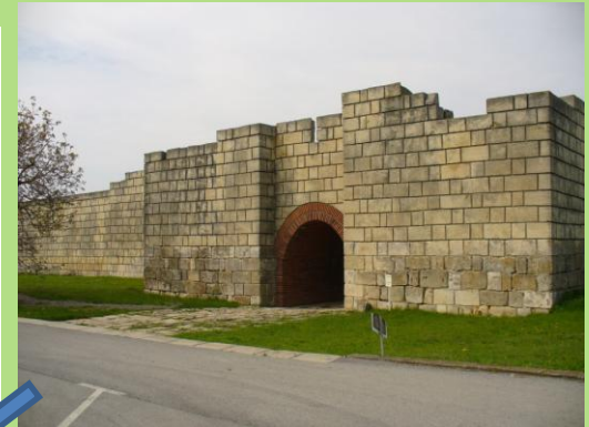
The Eastern Gate /reconstructed/