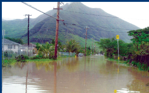
Hakimo Road Flooding, Waianae Coast by Sophie Flores. Photo courtesy of OahuMPO.