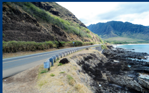
Retaining Wall to Shore Up Farrington Highway Near Makua.