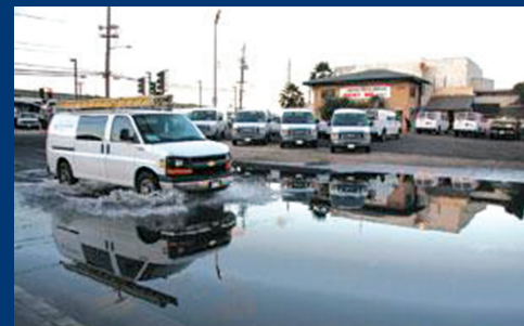
Flooding of Mapunapuna, January 28, 2011.